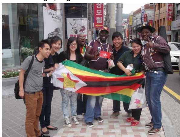
Leo club of Hong Kong

1830-2000 International show; this was a platform for social networking with Leos from other Districts and notably, we made links with Leos from Germany with whom we are cultivating healthy twinning and exchange programmes.