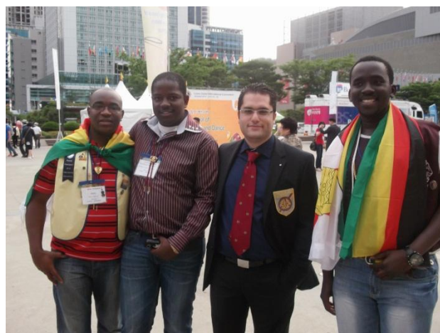
Leo President of Hamburg Omega Leos of Germany